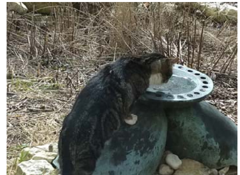
The neighborhood cat enjoying a drink of water from the Kissing Whales in the DUUC Memory Garden.

Church related events will be included in the Newsletter and Weekly Updates. Any non-church sponsored community events will be included in the newsletter, if spacing permit. Please email your submissions to announcements@dupageuuchurch.org .